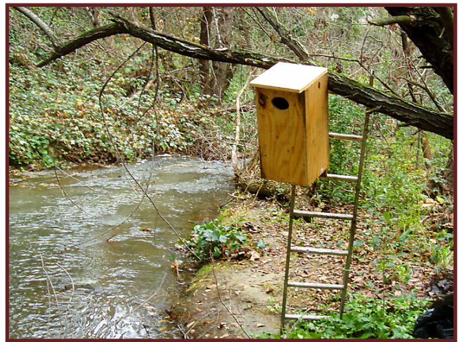
Wood Duck nesting box on San Ramon Creek in downtown Walnut Creek

Rent will eventually be collected—from the boxes now occupied by honey bees—for us to enjoy at meetings. This year an Eagle Scout candidate from Tracy provided us with enough Wood Duck boxes to install 12 boxes in San Ramon Creek from Macy's, downtown Walnut Creek, to Creekside